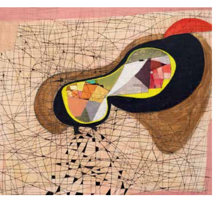
Double Trouble, 2017

See Goodman's solo show Jan. 24th - Feb. 23rd, 2019 at sikkemajenkinsco.com Art courtesy of the artist and baileygallery.com