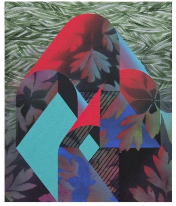
Nichole van Beek, Garden Maze , 2016, acrylic and fiber paste on dyed canvas, 18 x 5 inches.

MTM: These photographs and the animation that you were doing then, were they like what the paintings became? Because it seems like a lot of your paintings have this aspect in which it's a three-dimensional form that has been manipulated: extruded, convoluted, pushed and pulled.