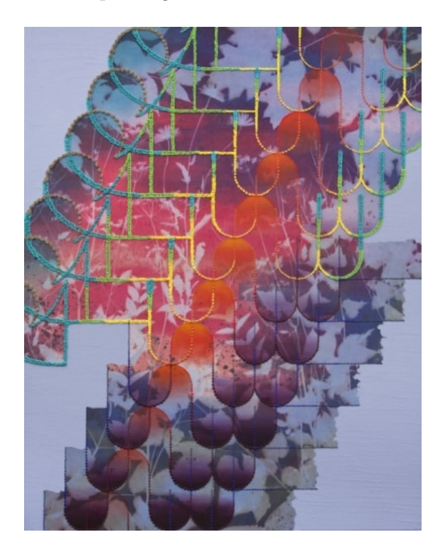
Nichole van Beek, From Rise to Set , 2016, acrylic and glass on dyed canvas, 48 x 38 inches.

NVB: I think everything with the pastry bag that I've done references some kind of weaving or textiles. In the first one everybody that came to the studio was like, did you just cut up some carpet and put in on your painting?