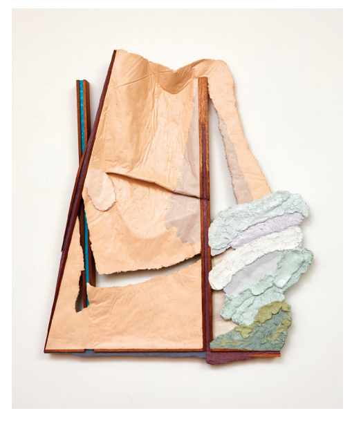
Load Correction (CF57), 2017 Epoxy clay, pigment, and wood; 24.5 x 21 x 3 inches

Such displays of sure-footed mutability and material invention have set Maychack on a solid upward course, advancing painting and sculpture in ways that call on art history, but without necessarily repeating it or following too closely on the heels anyone else's innovations save his own.