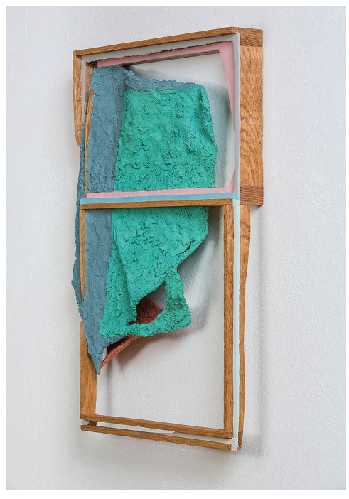
Compound Flat #59, 2017 Epoxy clay, pigment and wood 18 x 12.75 x 2.5 in.