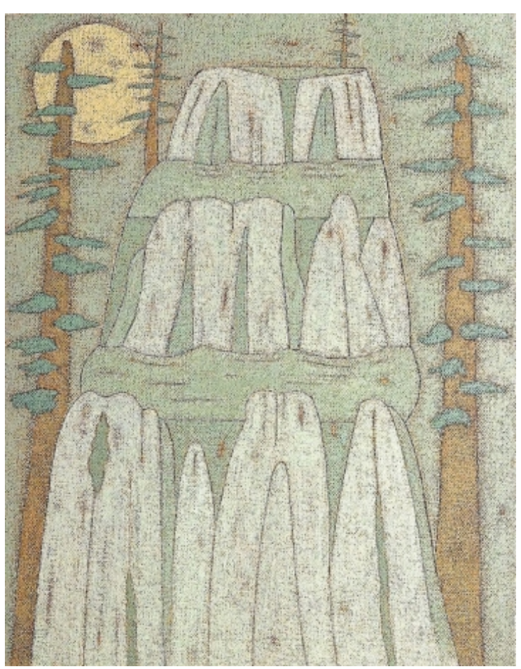
John Dilg, "Wahkeena" (2015), oil on canvas, 14 x 11 inches

formations, spiny pines, a river and/or waterfalls — presided over by a full moon in a celadon green sky punctuated by faint, orange stars. At various moments, while looking at exhibition John Dilg: Natural Memory at Taymour Grahne (October 28 – December 21, 2016), I was reminded of classical Chinese landscapes as well as the those glimpsed in the background of Early Renaissance paintings, such as Giovanni di Paolo's "Madonna of Humility" (ca. 1442), which is in the collection of the Museum of Fine Arts in Boston. Dilg's landscapes arise out of the collision of observation and memory, things seen and the history of painting remembered. The outlined pictographs encompassing his vocabulary of recurring motifs also share something with folk art. These associations enrich Dilg's paintings, which define a domain all their own.